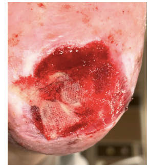
Week 5: One week post Dermacell AWM application