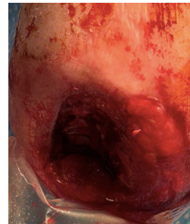
Week 4: Dermacell AWM application