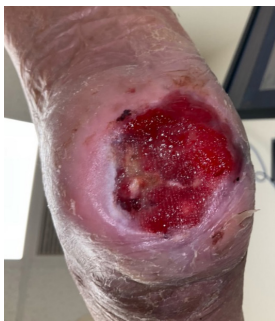
Week 8: Three weeks post Dermacell AWM; application of TheraSkin in the outpatient setting