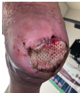
Week 9: One week post TheraSkin application