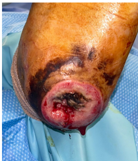
Initial Wound: After standard of care, pre OR debridement