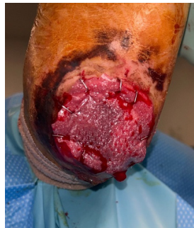
TheraGenesis Application 1