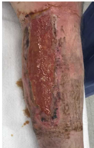
Week 9: Wound ready for STSG