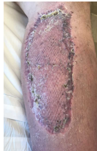
Closure: 19 weeks, wound healed