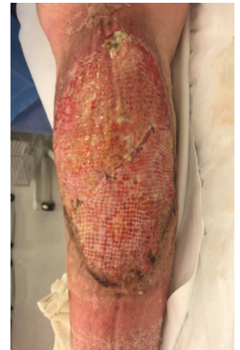
Week 1: Dressing change