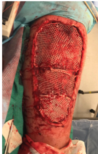
First Application: First TheraSkin application