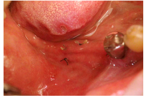
Figure 3. Post-operative healing and integration of Oracell at wound site by 8 weeks post-operatively

Results from case studies are not predictive of results in other cases. Results in other cases may vary.