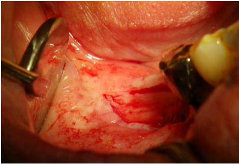
Figure 1. Pre-operative image showing lack of vestibule depth